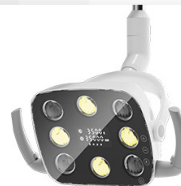
Yellow Light Mode