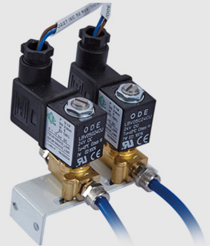
ODE Italy Imported Solenoid Valve