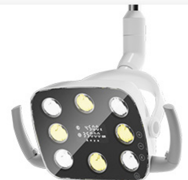
Mixed Light Mode