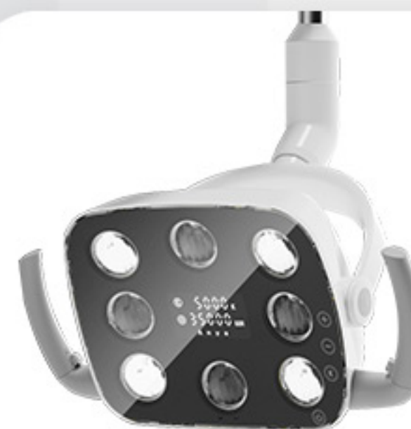
White Light Mode