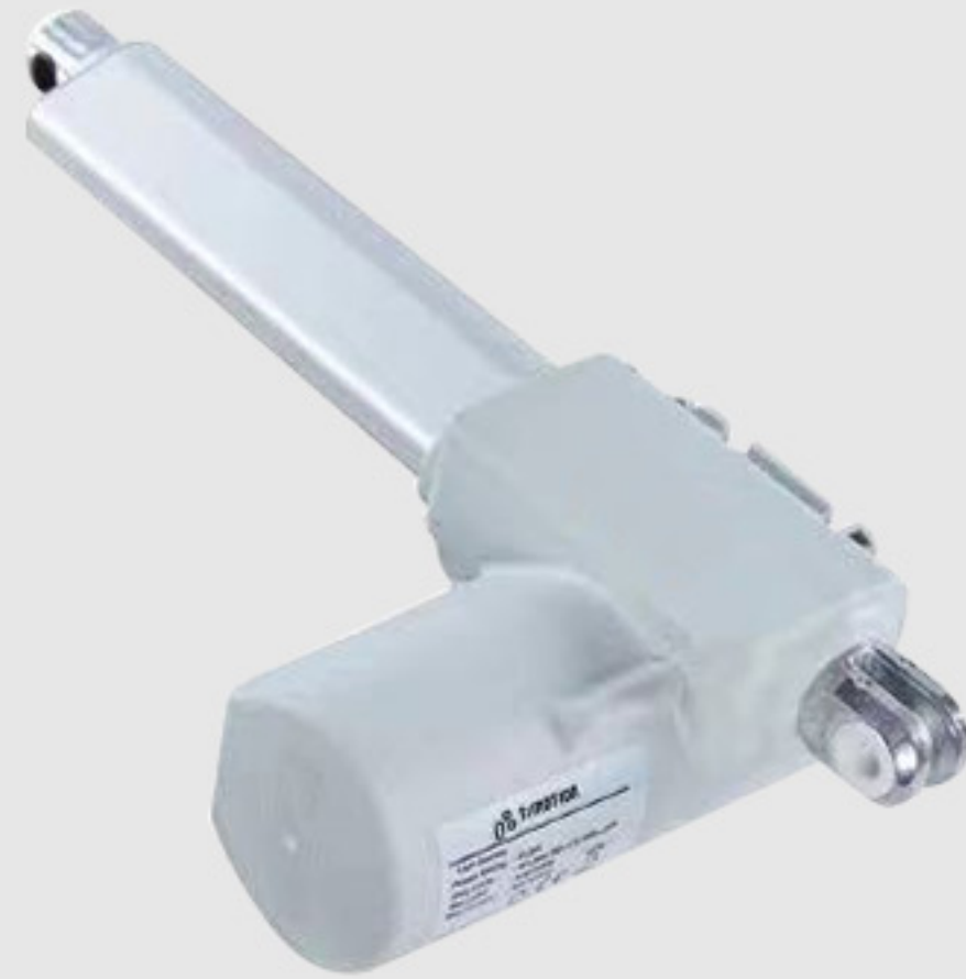
Taiwan Timotion Motor